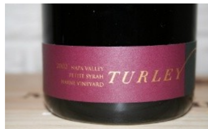
Try another Turley wine at Profugo's Wine Taste!